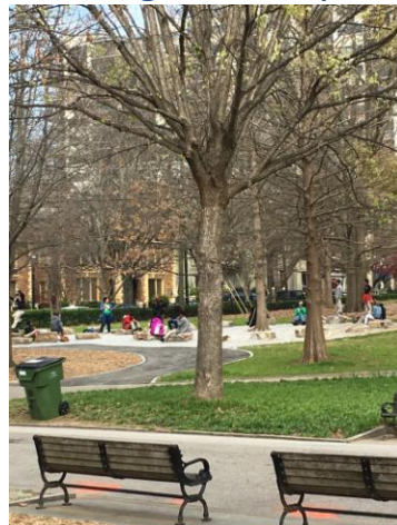
Figure 1 Brittany Molinaro of Piedmont Park Conservancy sent this photo with kids on a field trip playing on the rocks